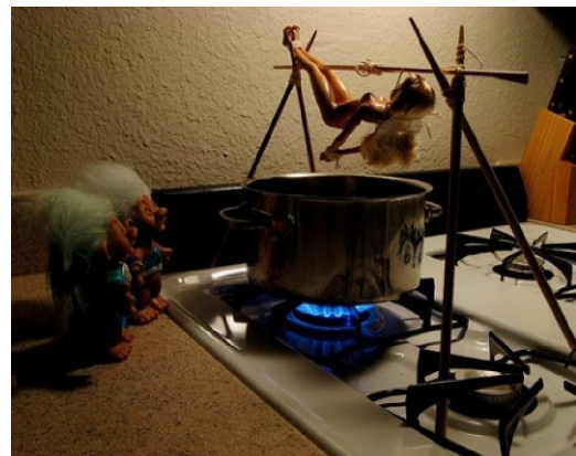
Figure 1: A typical day in the Trips office

It's ok if a chief isn't taking classes in the spring of 2011, or even in Hanover for the whole term. The chief only needs to be able to get to Hanover on a regular basis, as there's a lot of Trips work that needs to happen in the spring in Hanover, from croo selection to retreats to capture the wild moose that's been buttered from antler to hoof to regular games of twister.